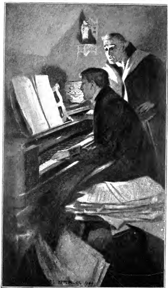
“THE CONVERT SAT IN HIS CHAIR NO LONGER, BUT STOOD SINGING BY THE PIANO”